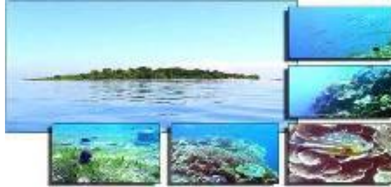
Habitat Protection and Enhancement