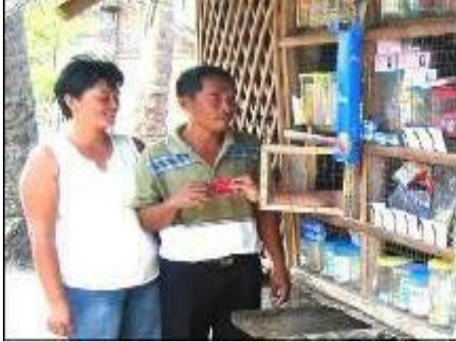
Community-based Family Planning